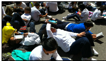
Students read in the main courtyard during the Reading Flash Mob

Students and parents were also asked to sign a summer reading pledge stating students would read thirty minutes each day . Reading practice was modeled and reinforced during two fun “Reading Flash Mobs” where all students, teachers, and staff (including the main office secretary and custodians) read for fifteen minutes together during the end of the school day.